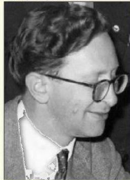
Vassily Smyslov in 1958

Smyslov a les Blancs dans les parties impaires