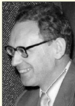
Mikhaïl Botvinnik in 1958